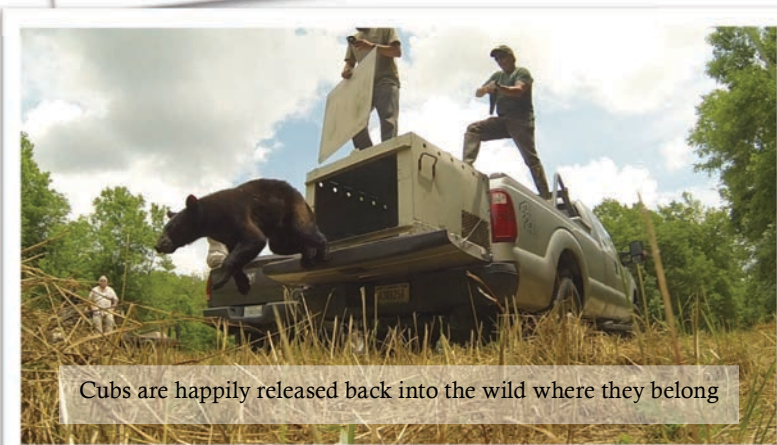
Cubs are happily released back into the wild where they belong