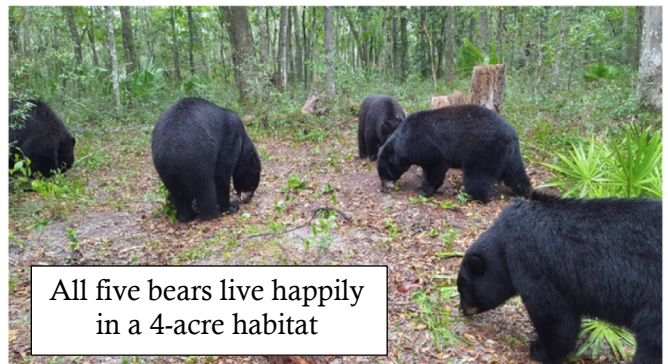
All five bears live happily in a 4-acre habitat