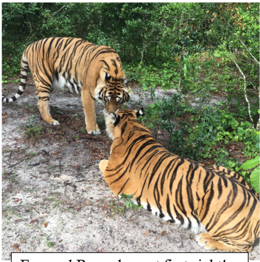
Eva and Roy – love at first sight!

When we rescued four tigers and two bears from a closed cub-petting operation in Colorado, we knew it would take some time to integrate them with our other animals and allow them to make new friends. Of course, we are a non-breeding sanctuary, so the matchmaking is strictly for companionship.