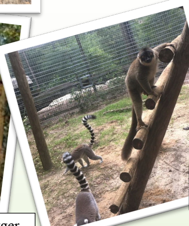
Lemurs are loving their new log platform and ladder