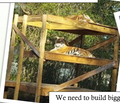
We need to build bigger tiger platforms!